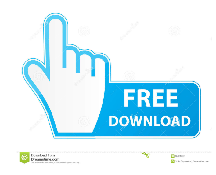
Device Information Crack Free [Win/Mac] [April-2022]